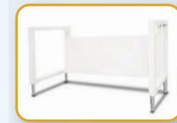
Support Stand with Levelling Feet (28 and 34 in)