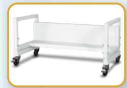
Telescopic Support Stand