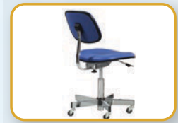
Ergonomic Lab Chair